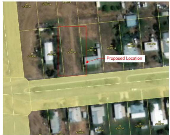
Figure 1: Project's Locality within Julia Creek, Queensland

The home shall be located on 71 Coyne Street Julia Creek, Lot 43 on JC55713. The site locality is shown below.