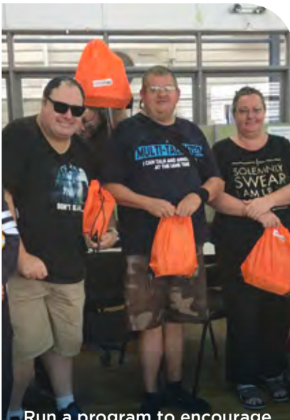
Run a program to encourage mental health wellbeing, diversity and inclusion in your school or workplace.